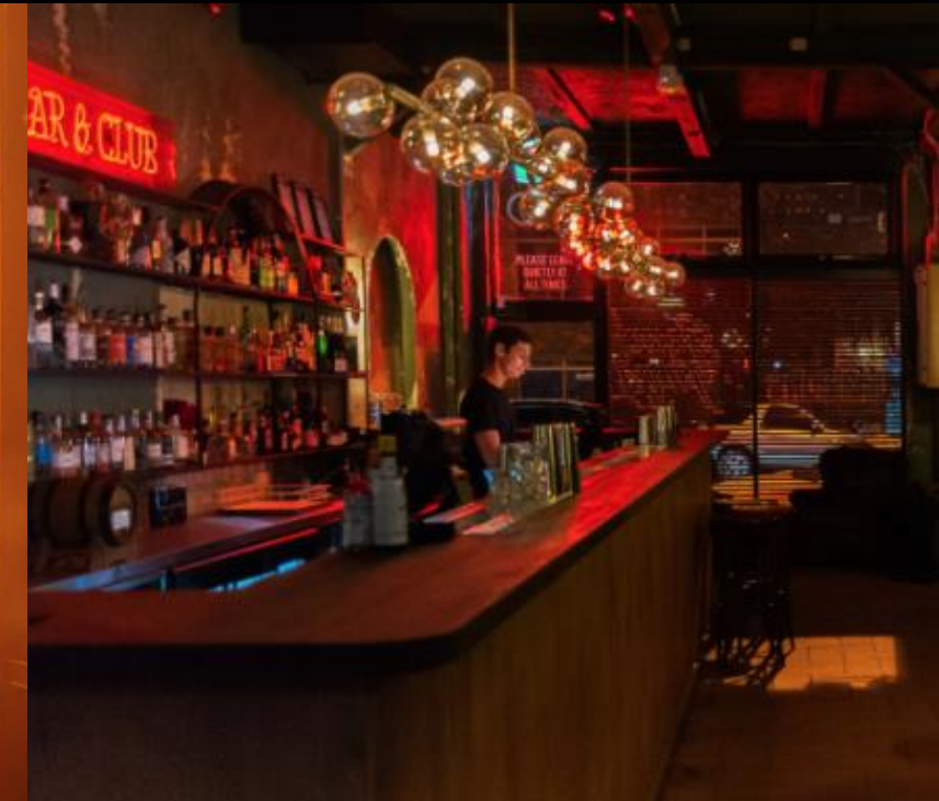
SPEAKEASY FOR GAY REPUBLICANS