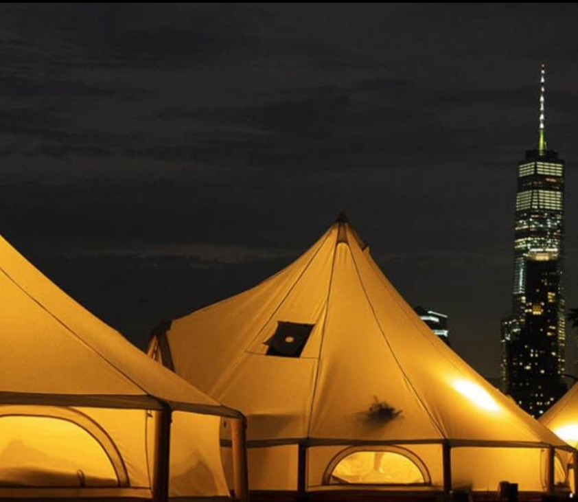
CLIMATE REFUGEE COOLING SHELTER

The only standing sets are the neighbors' respective apartments, 5A&5B , situated in their lively West Harlem building.