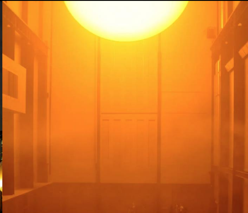
NEW-SPIRITUALIST CULT CENTER